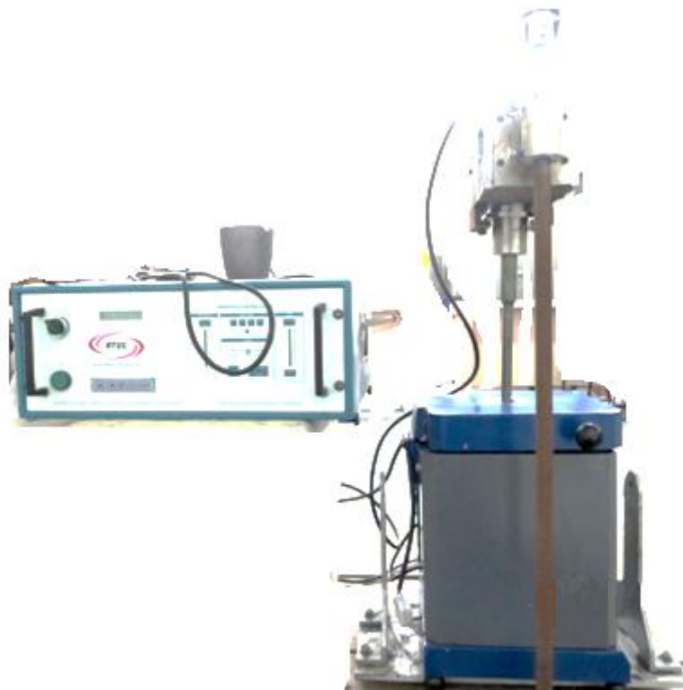
Front view of ULSONIK