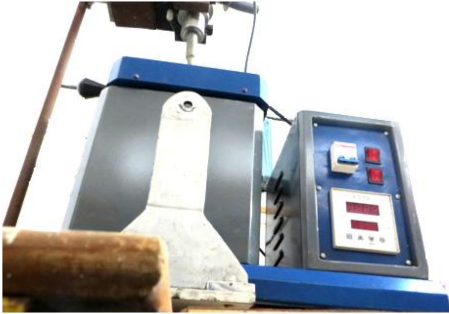
Right hand side view of ULSONIK