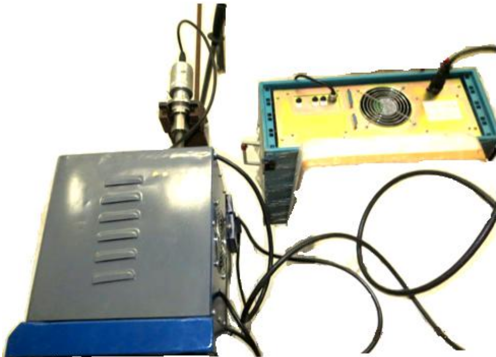
Bottom view of ULSONIK