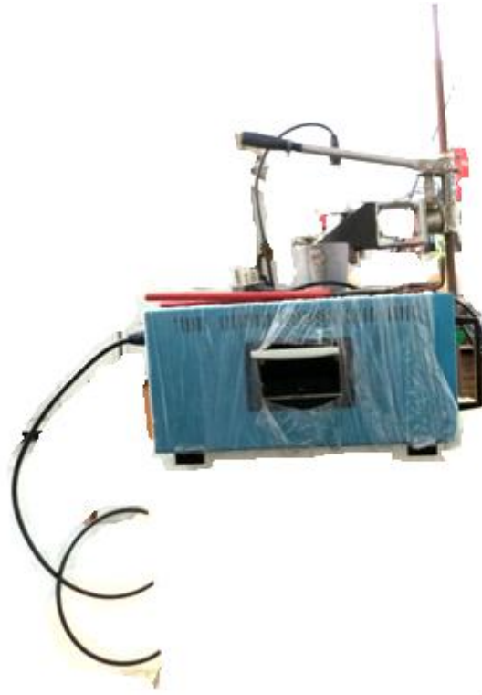
Left hand side view of ULSONIK